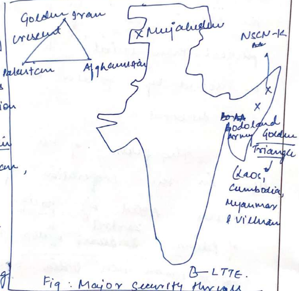
Fig: Major security threats in the region.

The sheltering of terrorists or organisation like Mujaheddin in Pakistan, ties of National Socialist Army , Khaplang